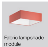
Fabric lampshade module