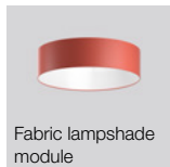
Fabric lampshade module