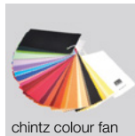
chintz colour fan