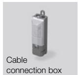
Cable connection box