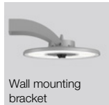
Wall mounting bracket