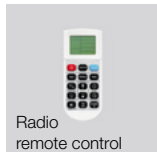
Radio remote control