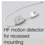
HF motion detector for recessed mounting